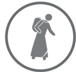
PEOPLE ON THE MOVE

There are more than 70 million forcibly displaced people in the world, viii comprising refugees, internally displaced people (IDPs) and asylum seekers. They face multiple barriers in accessing finance; are perceived as costly and risky clients; have limited legal rights; and often lack formal IDs. As crises become more protracted, longer term solutions and access to finance become critical to their survival.