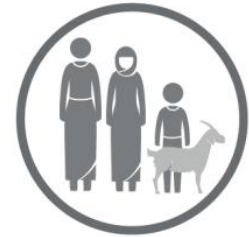
RURAL YOUTH & WOMEN

Just 59% of women own a bank account in developing countries; 10% less likely than men. iii Women are consistently under-represented and excluded, but like men, they must also have the power to accrue wealth, make decisions about how to use it, and be treated fairly and with dignity. iv Financial inclusion is a critical component of women's economic empowerment, which can result in better outcomes for children, household nutrition, and communities. v